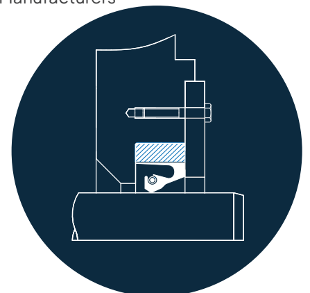
Above: Installation Drawing