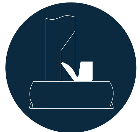
Above: Installation Drawing