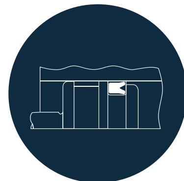
Above: Installation Drawing