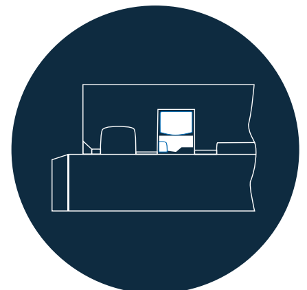
Above: Installation Drawing