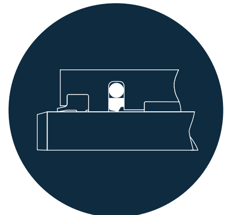
Above: Installation Drawing

Note: for other materials or fluids please contact our engineering department.