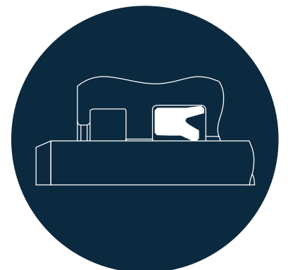
Above: Installation Drawing