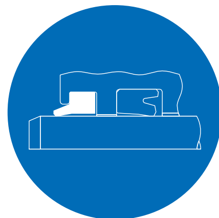
Above: Installation Drawing