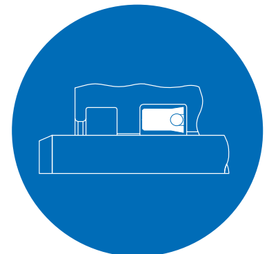
Above: Installation Drawing